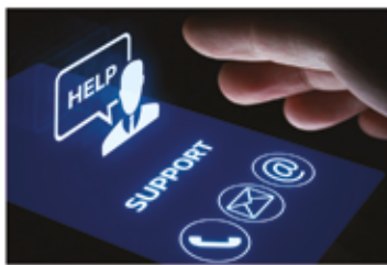
Advanced Digital Marketing