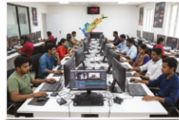
SEO & Social Media Marketing