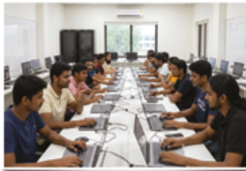
Website Design - Development