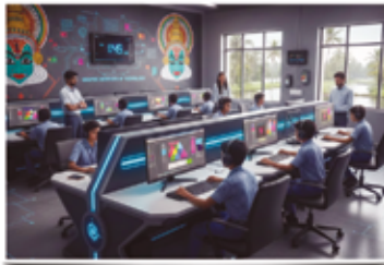
AI Based Graphic Design