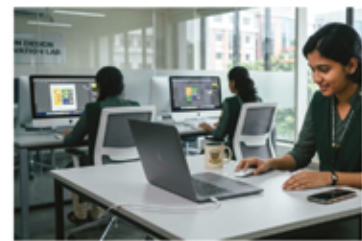
Live Project & Internship