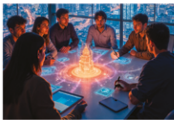
Product & Brand Management